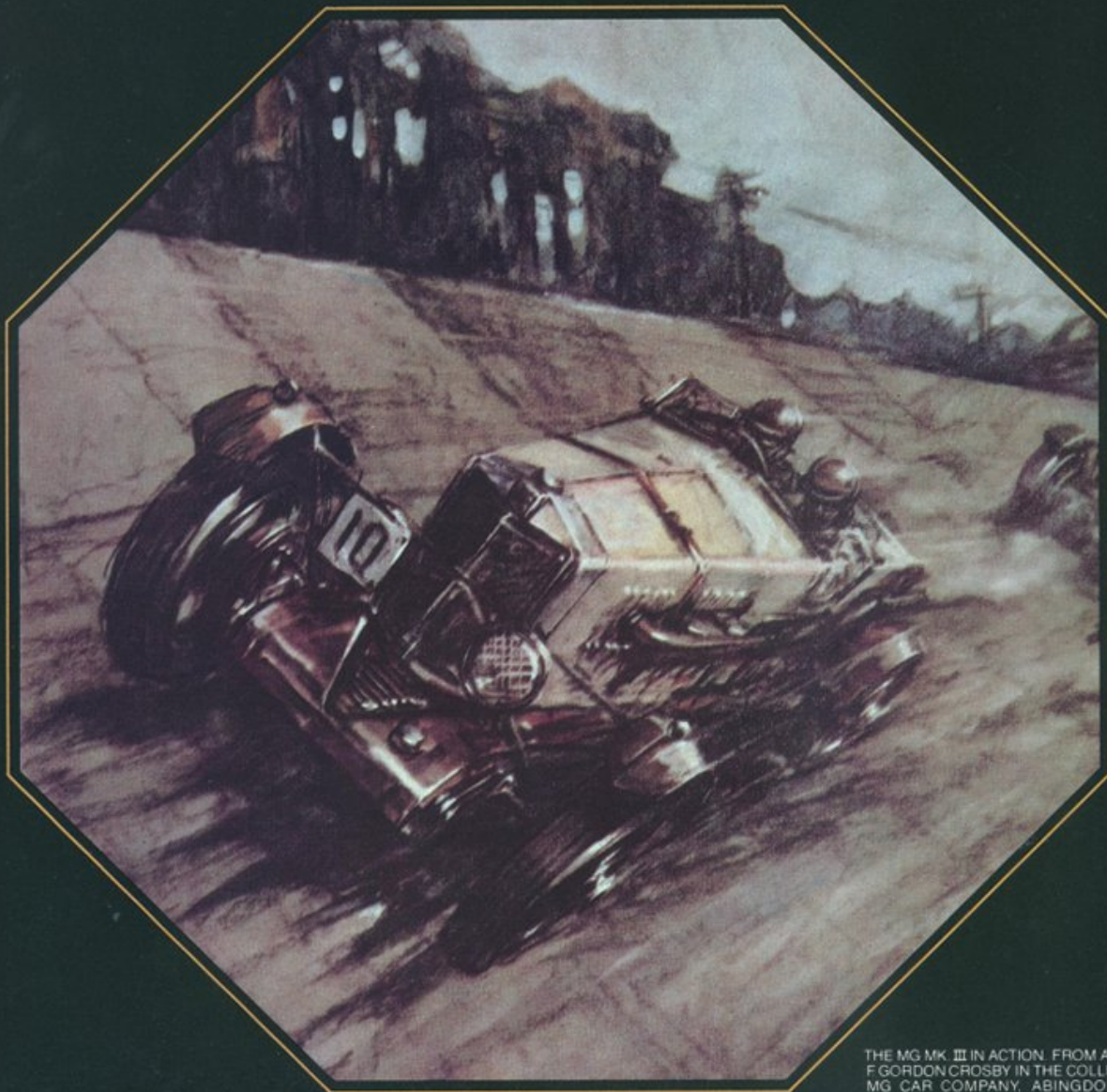
THE MG MK. III IN ACTION. FROM AN ORIGINAL BY F. GORDON CROSBY IN THE COLLECTION OF THE MG CAR COMPANY, ABINGDON-ON-THAMES.